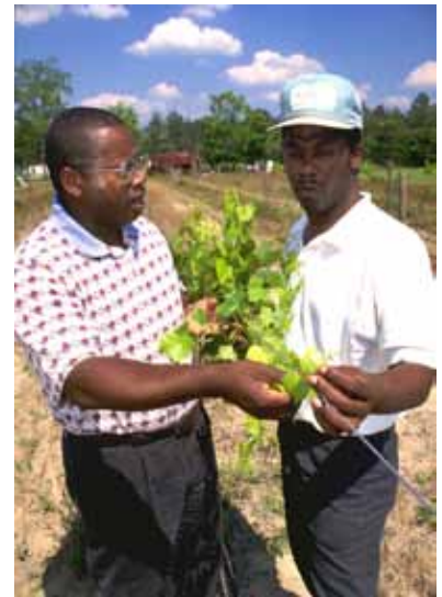
Number of Farms with Black or African-American Operators

Texas has 6,124 Black principal farm operators, the largest number in any state. Blacks make up 2.5 percent of the total farm operators in Texas. In 35 states, blacks or African Americans comprise less than 1 percent of all principal farm operators.